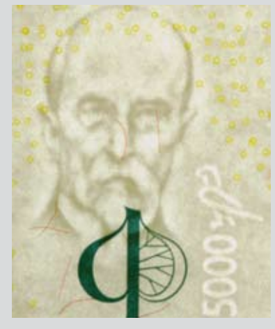
the watermark with a portrait of Tomáš Garrigue Masaryk visible against the light now also contains the number 5000 with a sitting eagle